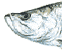
Superior May gulp air or feed near the surface