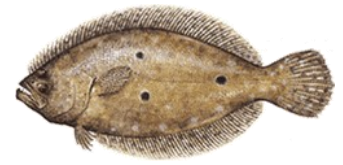
Dorsally Compressed Bottom Dweller