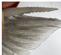
Venomous Spines Modified spines that inject venom