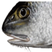
Barbels Sensory organ for taste/smell