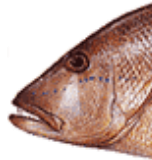
Terminal Active hunter, feeds in front