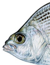
Eyes Size, location of eyes tells about quality of vision