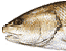
Inferior Feeds on, near the bottom