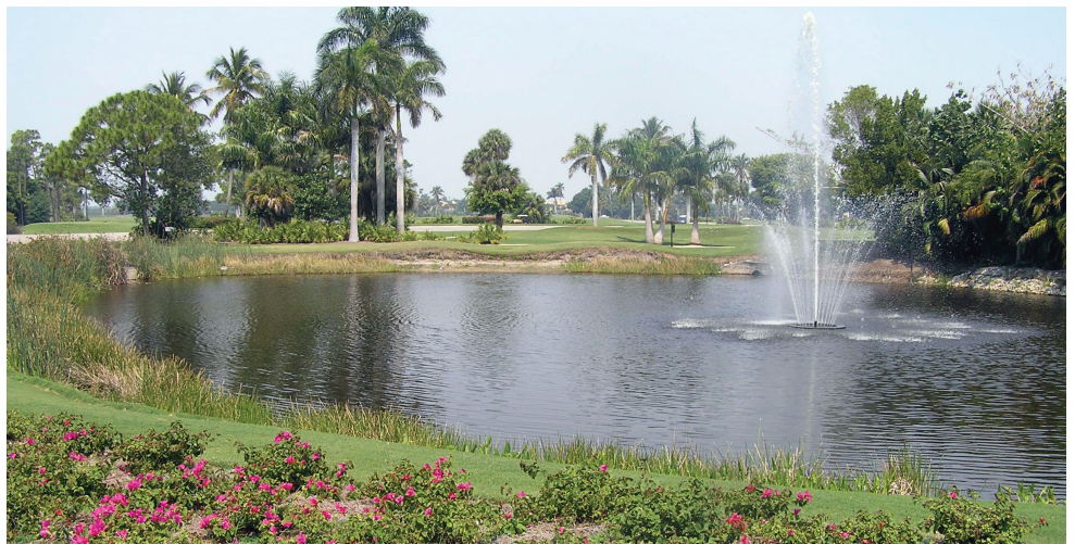
Top left: Commercial and recreational fishing are two large industries in the Rookery Bay estuary. Top right and bottom: Lawn maintenance and recreational activities use water that is diverted from above-ground retention ponds or drawn from underground aquifers.

To understand how water is used and appreciated in southwest Florida, the Rookery Bay National Estuarine Research Reserve partnered with Nova Southeastern University to research water attitudes, beliefs, and behaviors and interview local stakeholders. The primary goals were to understand attitudes, beliefs, and behaviors; explore community members' interests and experiences in engaging in water-related decision-making in personal and professional contexts; and to describe community members' experiences when receiving and responding to information about water-related issues. Results from this study can help water managers proactively resolve problems and implement collaborations with local experts based on what is important to the community.