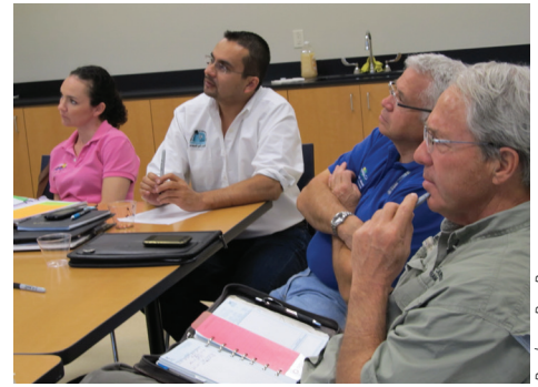
Rookery Bay Reserve

Professionals with water conservation expertise may be influential in educating other community members.