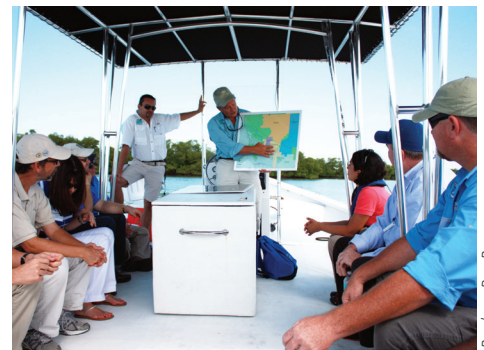
Rookery Bay Reserve